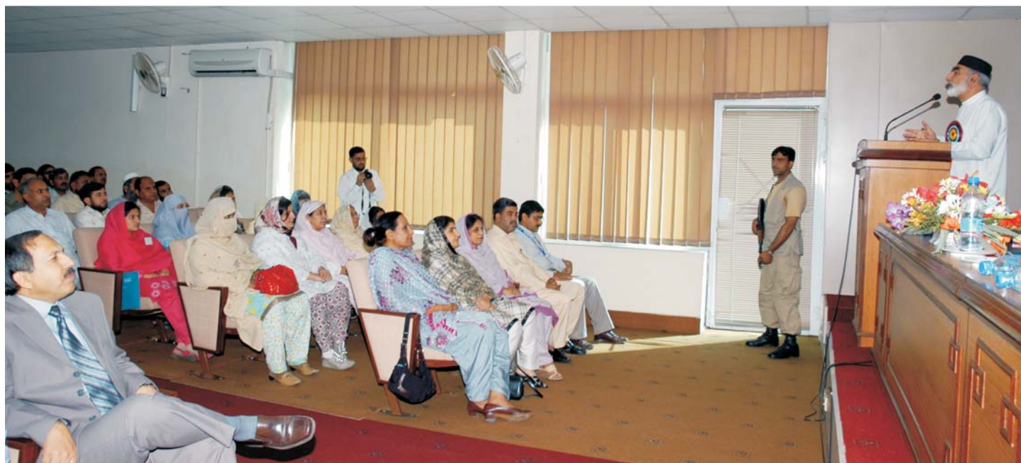
Mr. Owais Ahmad Ghani, Governor, NWFP addressing the concluding session of the training course at NIFA, Peshawar.

informed that PAEC is running thirteen cancer hospitals across the country providing diagnostic and treatment services to around 500,000 patients annually at no cost to majority of them. Five such Cancer hospitals are coming up soon.