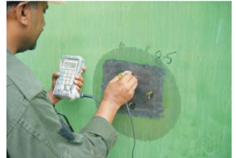
Thickness measurement on Fire Water Storage Tank.

team monitored magnetic particle testing, dye penetrant testing, ultrasonic flaw detection & thickness measurement performed by M/s Inspectest (Pvt.) Ltd. Lahore and pressure safety/relieve valve testing which was done by M/s Reets