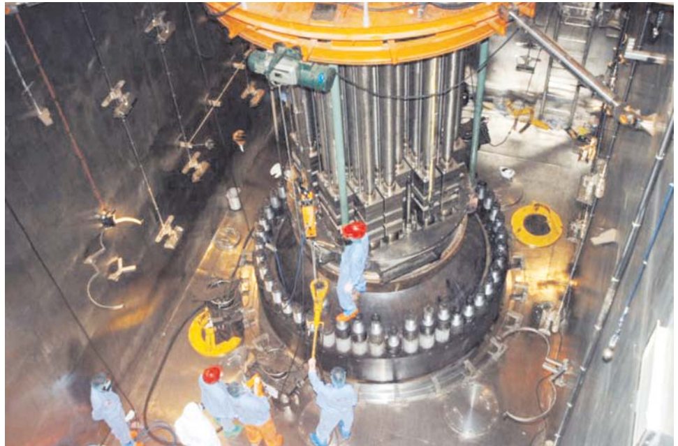
Reactor Pressure Vessel (RPV) Head lifting.

A significant milestone, achieved by C-1, was the replacement of third seal of Reactor Coolant Pump-A/overhauling of Circulating Cooling Water Pump # 4 and completion of 544 maintenance jobs declared as pre-outage /non-RFO jobs before the start of refueling outage resulting in reduction of outage duration.