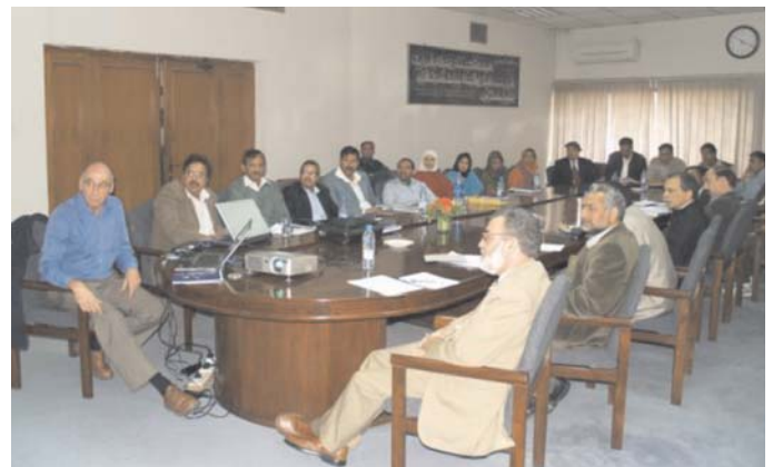
Deliberations between visiting scientists and their local counterparts during the PAEC-CSIRO workshop on "Vegetation-based Management of Salt-affected Lands" at NIAB, Faisalabad. ■

It may be recalled that PAEC's NIAB has played a pivotal role in the establishment and dissemination of biosaline technology, which it is sharing with nine IAEA member countries under the auspices of IAEA.