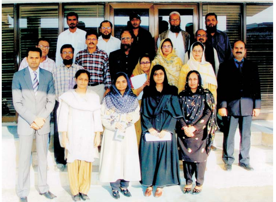
Group photo of the participants of the workshop.