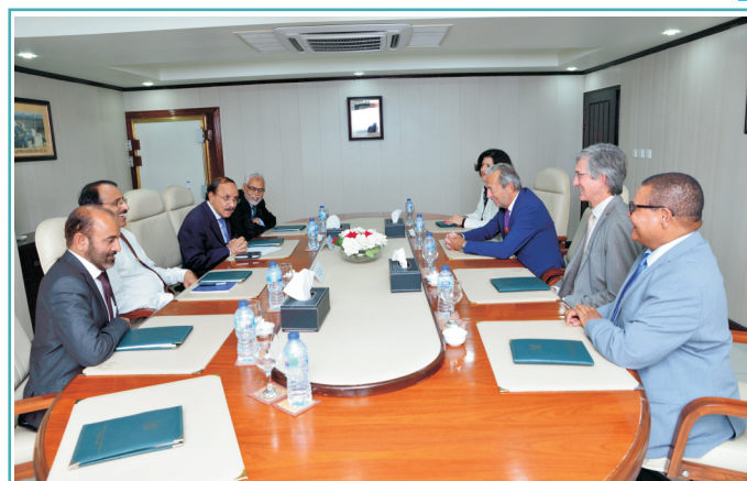
Participants of PAEC-IAEA Safeguards Bilateral Meeting

The Agency appreciated the non proliferation efforts of Pakistan and acknowledged every step taken by PAEC in this regard. PAEC management accentuated the long history of relation between PAEC and IAEA on Safeguards implementation.