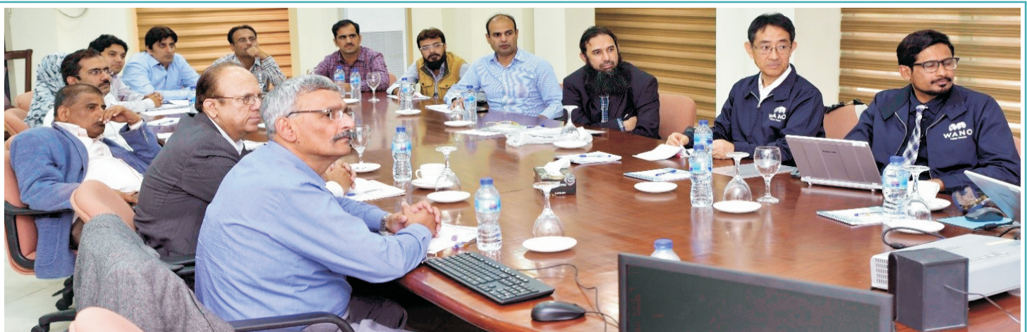
Participants at WANO OE Caravan

the mission included WANO OE reporting indicators and current OE status, trending and analysis of OE reports, overview of WANO Significant Operating Experience Reports (SOERs) implementation status and SOERs on Operators Fundamental Weaknesses and Risk Management Challenges. With these presentations and mutual discussions, the participants had the opportunity of learning WANO OE program and sharing their expectations and experiences. Finally, WANO team leader thanked PAEC for its hospitality and preparation in hosting the OE Caravan.