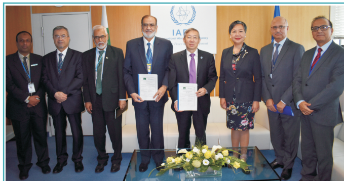
Group photo after signing CPF ceremony

During 63 rd General Conference (GC) of IAEA, signing ceremony of the Country Program Framework (CPF) for next 5 year was also held in the IAEA, Hqs. IAEA's DDG, TC and Chairman PAEC signed the agreement. This is the four CPF of Pakistan developed with various stakeholders to meet sustainable development goals. Based on the lesson learned and experience gained from implementing previous CPF, the technical cooperation activities in this CPF will Focus on Food & Agriculture, Human Health, Water Resource Management, Nuclear Safety, Radio Active waste Management, Nuclear Power Development, Industrial Application, Climate Change and Environmental Protection, Nuclear Safety Physical Protection and Safe Guard.