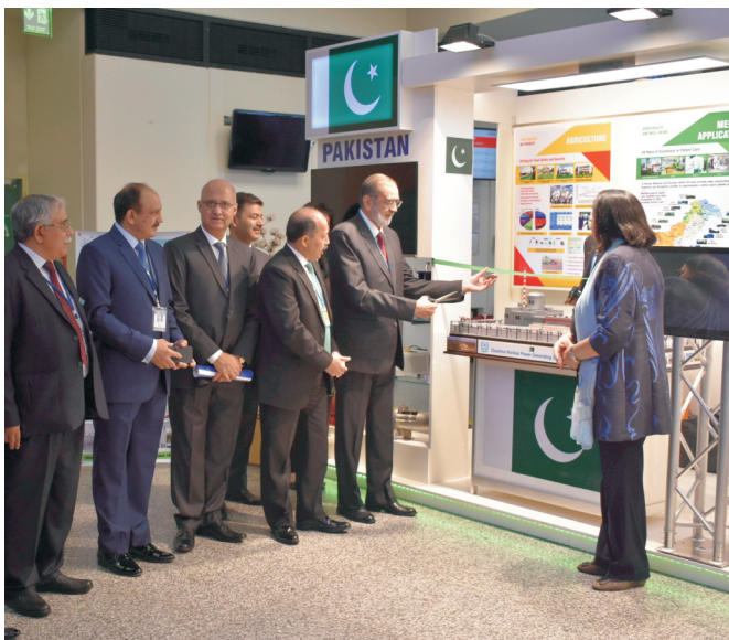
Chairman PAEC inaugurating the Pakistani Stall