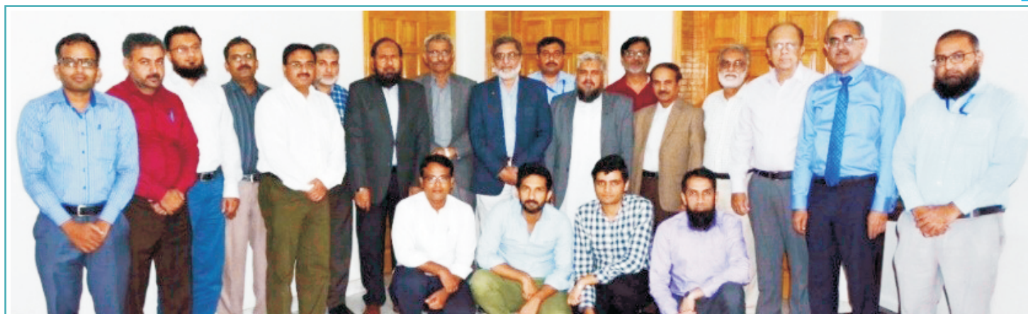
A group photo of the participants