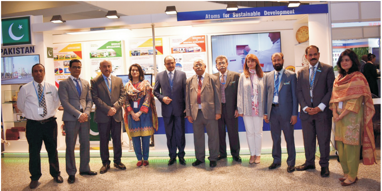
Pakistan Atomic Energy Commission Exhibition Team at IAEA

The IAEA General Conference continued till 20 th September and so did the exhibition, a sideline event for the awareness of IAEA dignitaries and delegates of other IAEA member states.