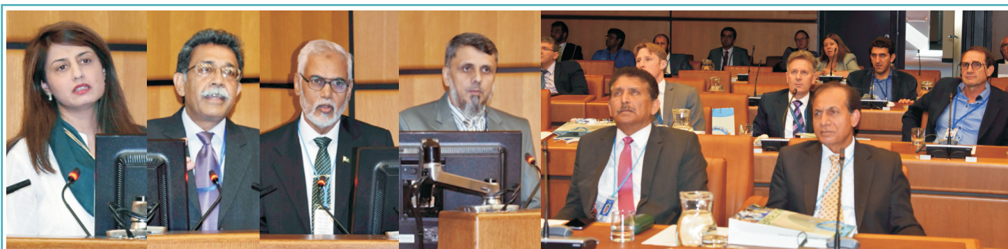
Pakistani experts delivering lectures in IAEA Exhibition side event

A side event was also held on 18th September, 2019 during IAEA GC & Exhibition. This side event was held to highlight the contributions & efforts made by Pakistan to achieve sustainable goals (SDG) in the country.