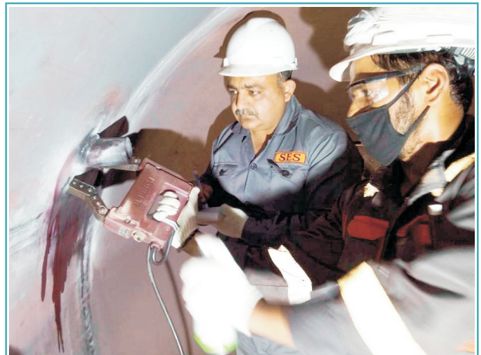
Third-Party Inspection activities on Feed Water Tank

Deaerator Vessel and Feed Water Storage Tank. The team monitored Magnetic Particle Testing (MT), Penetrant Testing (PT) and Ultrasonic Thickness Measurement (UTM). On Unit # 1, the inspection activities were performed by SGS Pakistan (Pvt) Ltd while on Unit # 2, were performed by M/s Inspectest (Pvt) Ltd. For both the Units, all activities as per scope of TPI were successfully completed. Uch Power management highly appreciated the NCNDT for its performance.