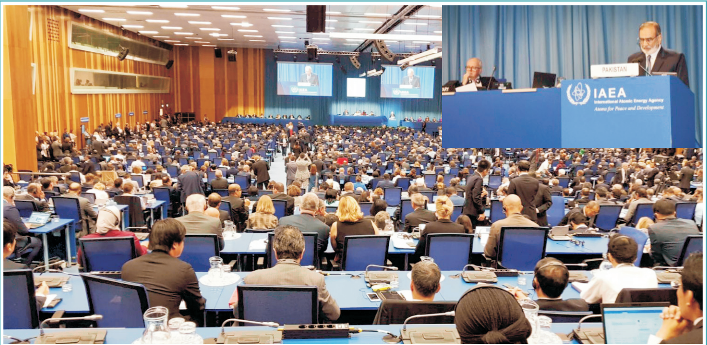
Chairman PAEC Addressing the 63rd IAEA General Conference at Vienna