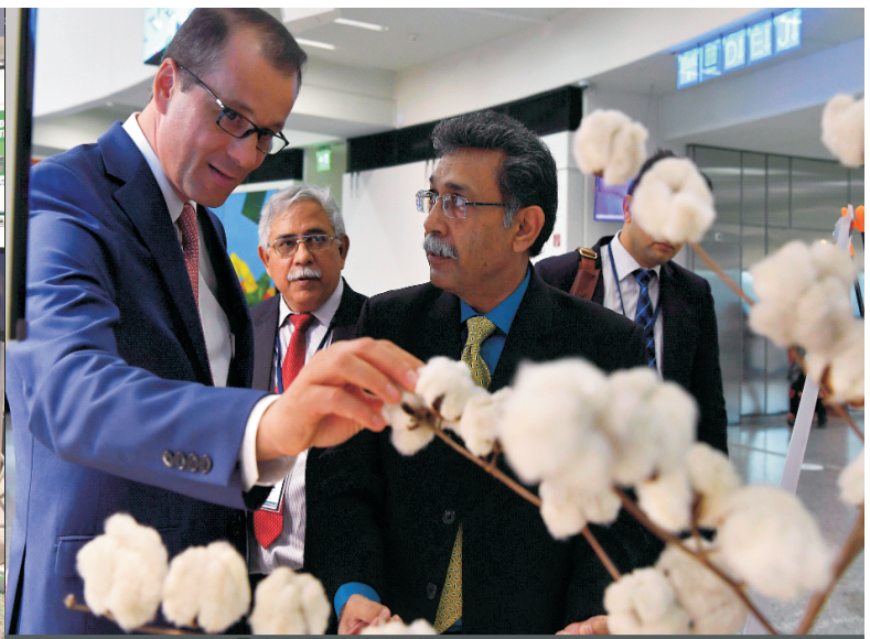
DDG, IAEA showing keen interest in cotton plant at Pakistani Pavilion